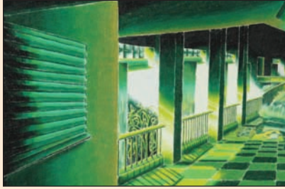
From a previous Future Makers exhibit: Daniel Molsbee (Poteet HS) Hallway , green color perspective

"Future Makers 2011: Work by MISD High School Advanced Placement Art Students" March 10 - 24, 2011 Closing Reception: March 24, 5:30 - 7 p.m.