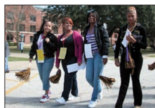
On February 23, 41 students from the Eastfield Educational

On January 29, Eastfield's Talent Search program and the Financial Aid office took part in the Sallie Mae Fund Paying for College Bus Tour hosted by Samuell High School. Over 60 students and their parents attended the event. Since 2004, The Paying for College Bus Tour has reached more than 130,000 families nationwide and has awarded over $400,000 in scholarships. A $1,000 scholarship was presented to one of the Samuell students following the tour. The event communicates the benefits of a college education, demonstrates that college is affordable and accessible for all families, and encourages low-income and minority students to enroll in college.