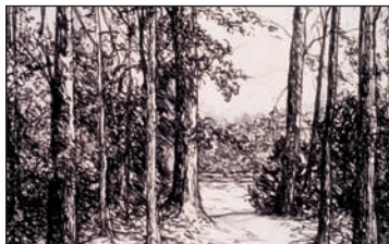
"Path on the Edge," charcoal on rag paper, 2007