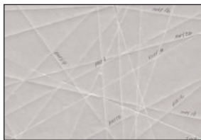
everyday in may, 2010, paper, graphite