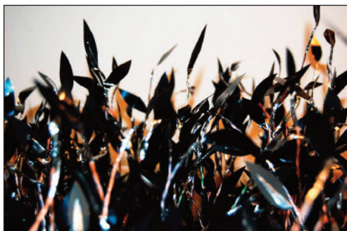
Jennifer Pepper, "Stilt Grass," magnetic tape, wire and text, 2011

Gallery 219 at Eastfield College presents "Itch," an exhibition of new work by Jennifer Pepper from September 1-30,